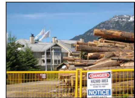
Site of Whistler Medals Plaza – the last urban forest in Whistler Village

British Columbia is legally Indigenous territory. The Royal Proclamation of 1763 states that the Crown must sign treaties with the Indigenous people before land can be ceded to the colony. This did not happen in most parts of B.C., including the host Lil’wat and Squamish Nation lands, where Whistler is located.